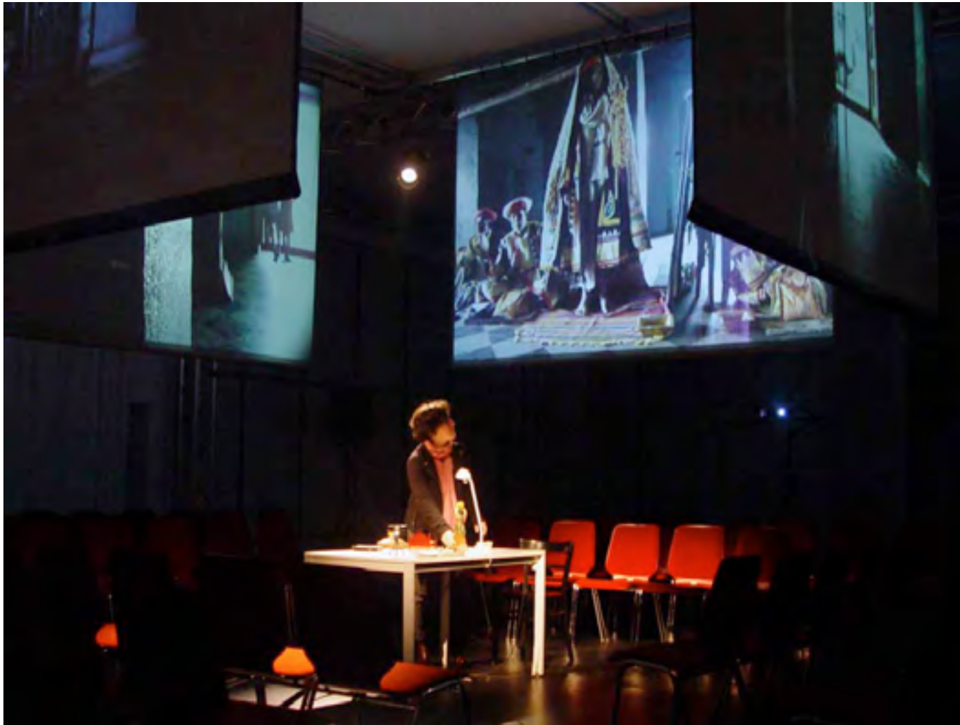
Interactive 4 ch Video Installation with interactive Objects by Chris Ziegler