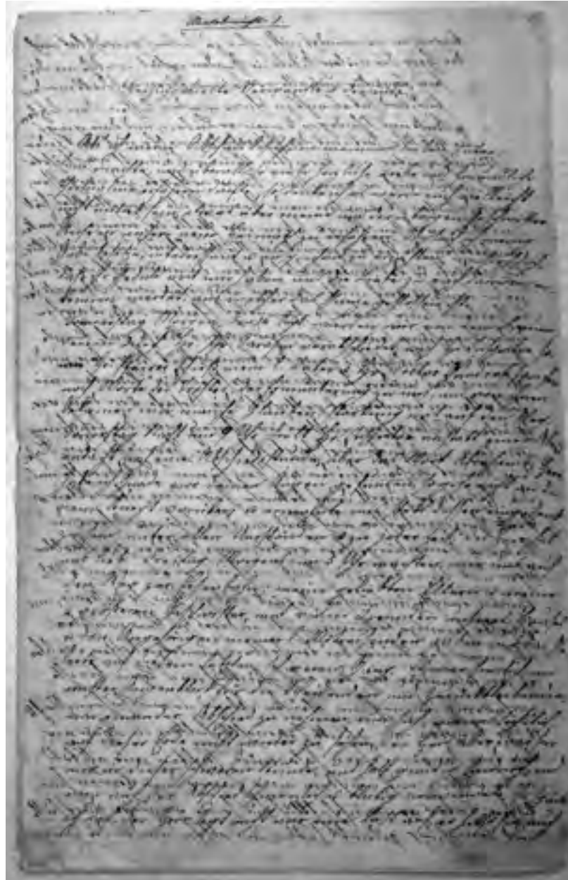
Diary (Basel Mission Church Archive, Basel Switzerland)