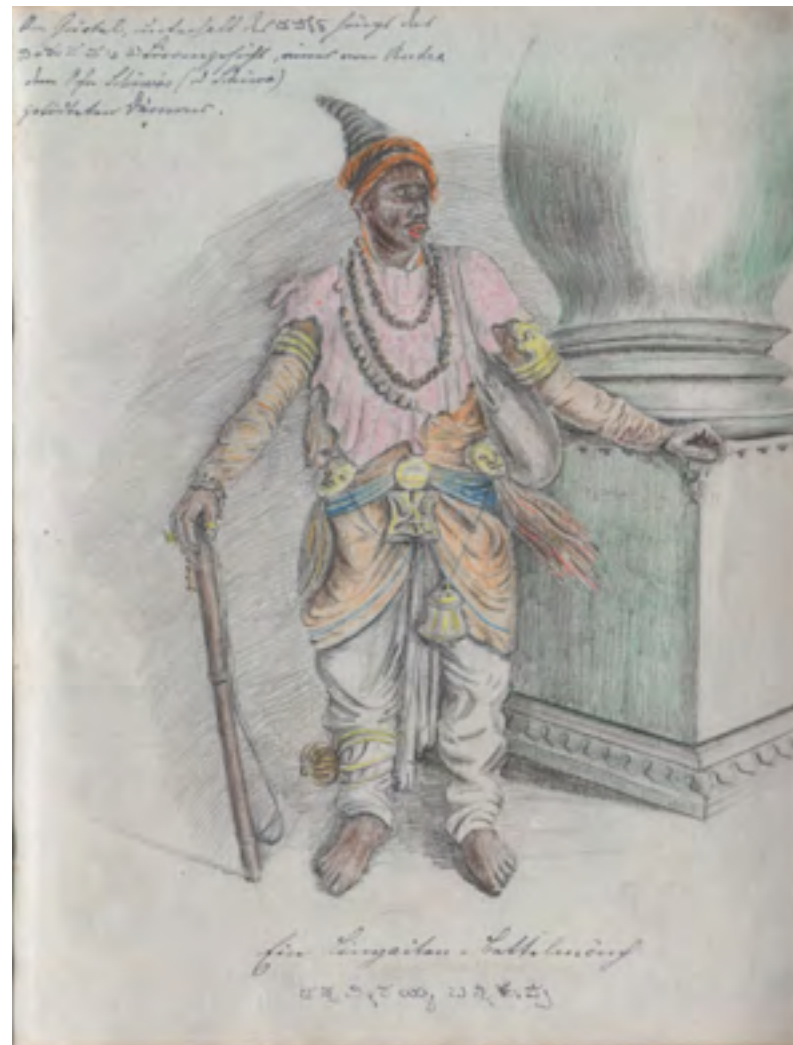
Ein Lingaiten = Bettelmönch